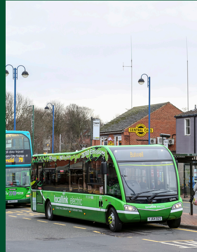
Effective from 24th June 2019

City, Hyson Green, Bulwell, Norwich Gardens, Morrisons