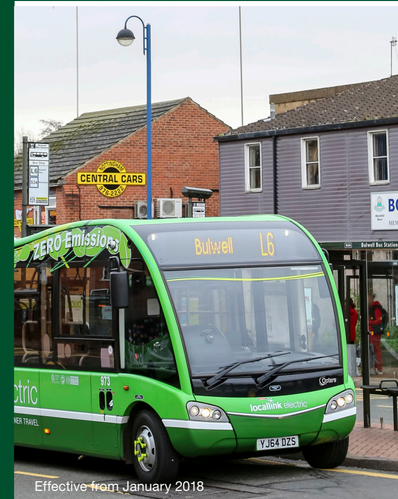
Effective from January 2018