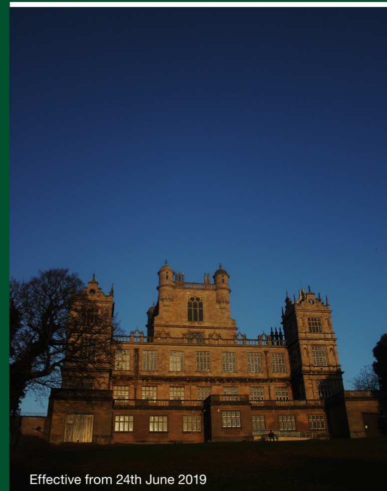
Effective from 24th June 2019